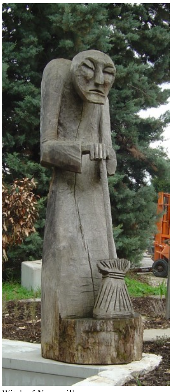
Witch of Neuveville