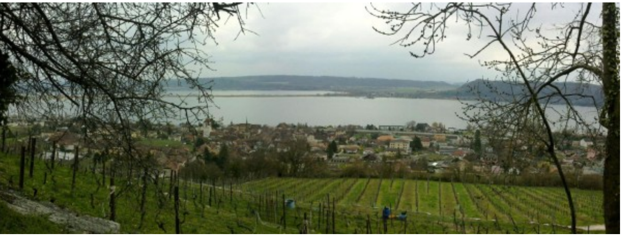
View from the picnic site